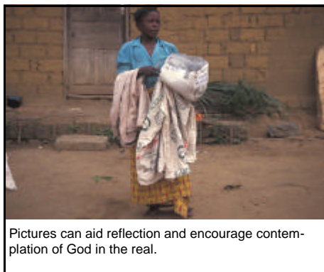
Pictures can aid reflection and encourage contemplation of God in the real.

Although we have talked much about how we can make Christmas sustainable, environmentally and with a concern for the poorest, we have not focussed much on personal issues. Sustaining ourselves for 'resistance' is the other side of the coin.